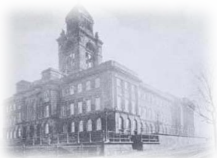
Wallasey Town Hall