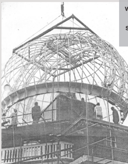
The tubular steel dome frame, weighing 12 tons, is lowered towards waiting workmen who will help in setting it into position atop the Great Equatorial Building.